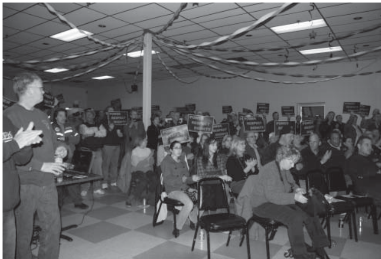
Local 1833 members at rally