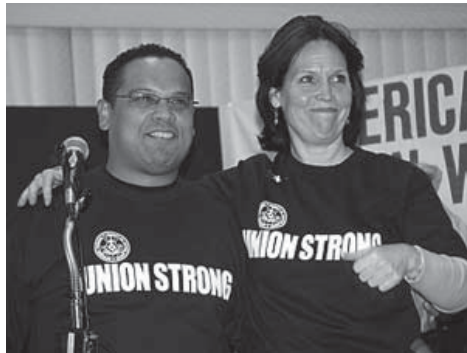
Minnesota Representatives Keith Ellison and Betty McCollum