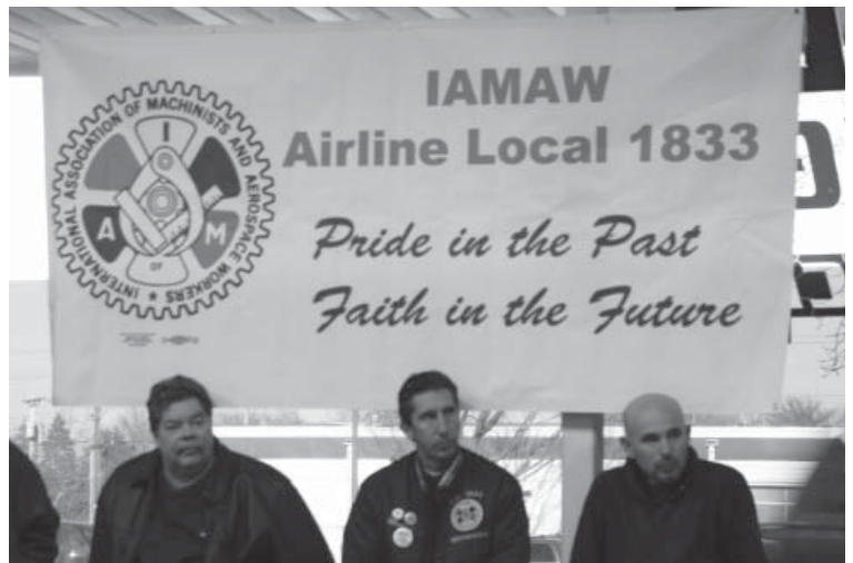
A captive audience